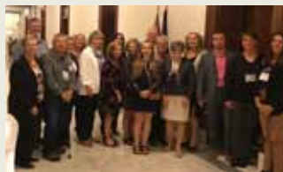
Senator Joni Ernst meeting

Members of Iowa NAHRO traveled to Washington DC to meet with the Iowa Congressional offices. The visit included meetings with the offices of Congressman David Loebsack, Congressman Rod Blum, Congressman David Young, Congressman Steve King, Senator Joni Ernst and Senator Charles Grassley. At each meeting, we presented a copy of the " Iowa Is Losing Housing Funds to Other States ". We discussed the problems portability is creating for Iowa Housing Authorities and made recommendations for changes that would eliminate or reduce the loss of housing funding in Iowa. They were all very aware of the portability issue and were receptive of our recommendations. Many offices agreed to collaborate with other offices and include Iowa NAHRO in the negotiations. It was a very successful day of meetings.