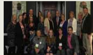
Congressman David Young meeting

Before closing, I would like to recognize a few Iowa NAHRO members with many years of service in Housing.