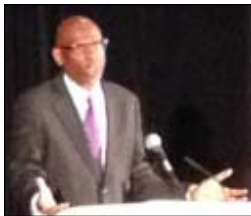
Featured Speaker: Geoffrey Canada, President and CEO of the Harlem Children’s Zone.