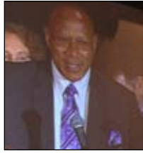
Featured Speaker: Eugene Robinson, Correspondent for The Washington Post, 2009 Pulitzer Prize Winner and author of “Disintegration: The Splintering of Black America.” Presentation Topic: The Cleveland Experience—History of Public Housing From those Who Lived It.

The Board of Governors and Leadership Team were guests of a Brown Stadium tour and reception, while conference delegates enjoyed a rock and roll themed evening event in Cleveland, home of the The Rock and Roll Hall of Fame and Museum .