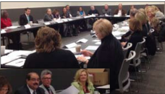
Board Meeting in Cleveland, OH.

Thank you all for the pleasure and honor of serving as your President and wish the new Board the very best in the coming years.