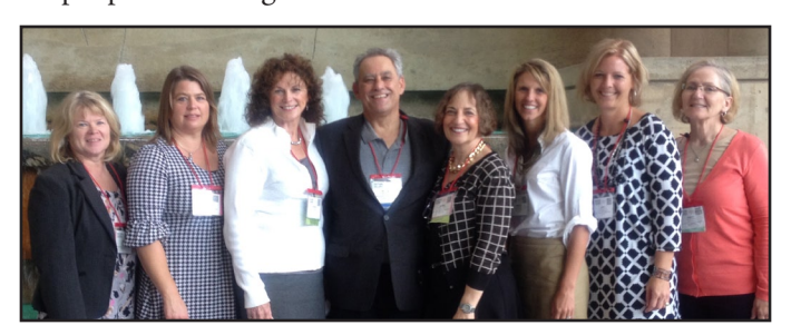
Minnesota Delegation in Baltimore

The Minnesota NAHRO Chapter again had excellent representation at the National NAHRO Annual Conference with 13 people attending the conference.